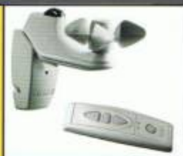
Optional Sun and Wind Sensor

The BX260 Series are compact and relatively flat cassette awnings with its own unique contemporary design. Attention to technical details ensures years of trouble free operation.