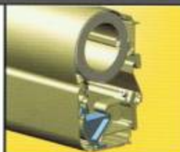
Attention to function & form