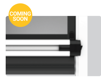
Extra Large Weather Strip (60mm)

Blocks weather and other debris when large gaps are present.